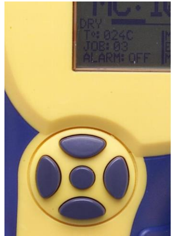
Figure 1 Keypad Layout

The meter uses an on-screen, menu-driven approach to navigate through the meter features, allowing for an intuitive understanding of keypad functions. Each screen presents the user with a number of selectable options. One of the options is always selected and the user can move (navigate) the selection to any other available option. The keypad is aimed at providing navigational control, and not at accessing specific features. There are four directional keys aligned intuitively around a middle (fifth) key (see Figure 1): Above (UP), below (DOWN), to the right (RIGHT) and to the left (LEFT). The middle key is used to SELECT the option highlighted on the screen. For purposes of this owner's manual, the five keys will be referred to as \Leftrightarrow \Rightarrow \Uparrow and SELECT.